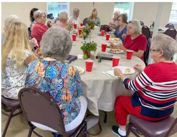
A scene from May's Ladies Luncheon.